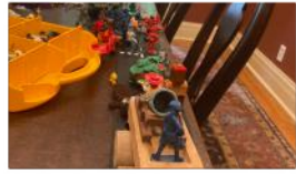
PARADE THAT WU-WU-ZAP IS GOOD