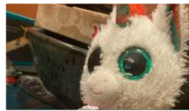
UNI IN FORT AGAIN