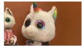
PIXY ON BUFFET