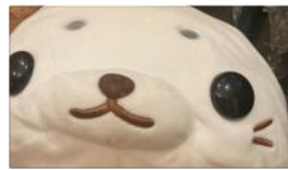
GODZILLA BECOMES FRIENDS WITH UNI